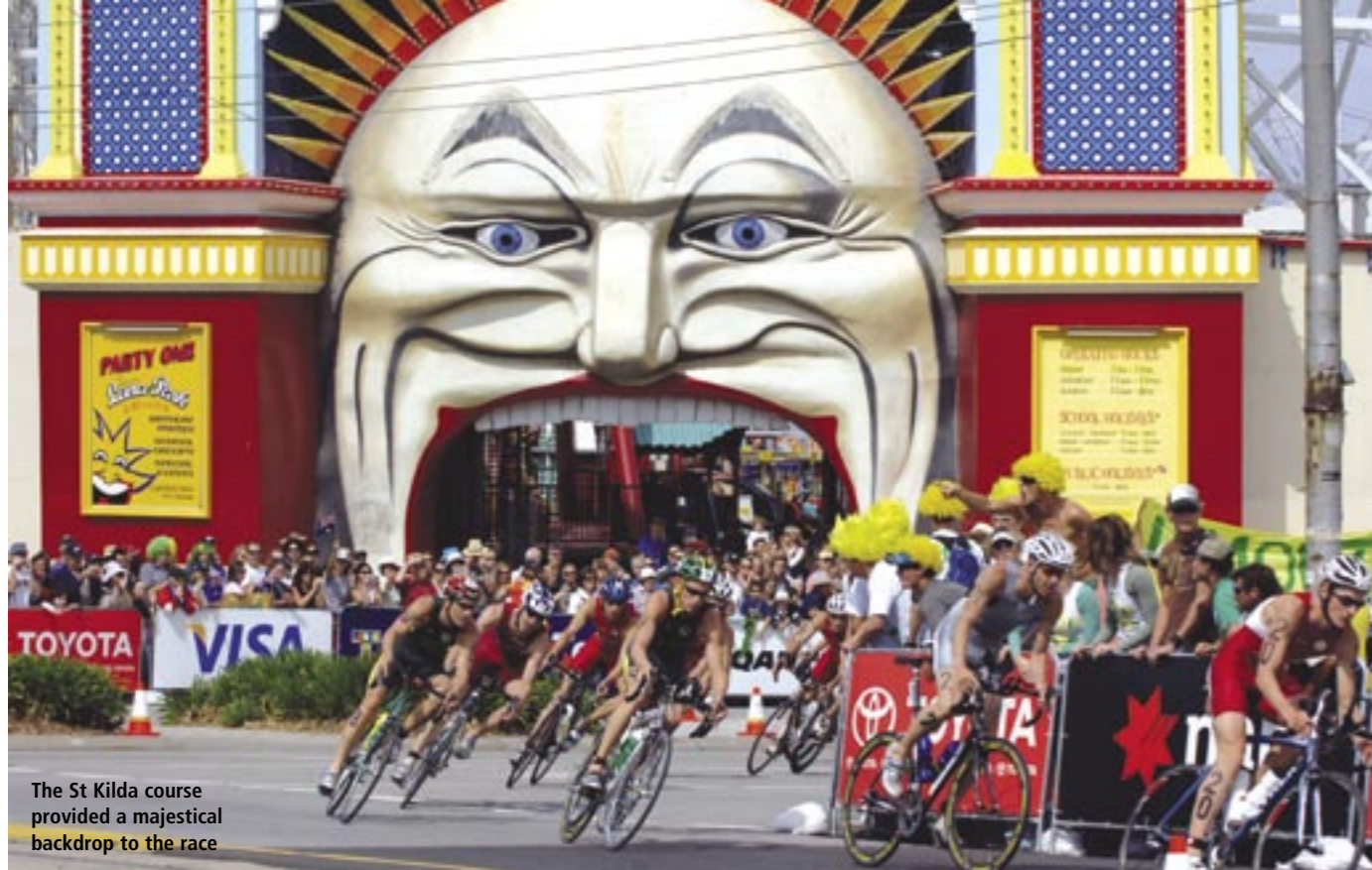
The St Kilda course provided a majestic backdrop to the race