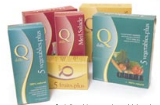
Q-daily – it's nature's multivitamin

For more information visit www.qdaily.com.au or call 1300 QDAILY (1300 732 459).