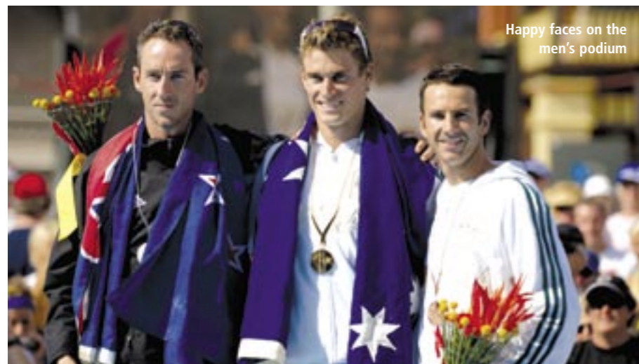
Happy faces on the men's podium

"Wow... I never thought I'd be so excited to win a bronze medal. It's just awesome